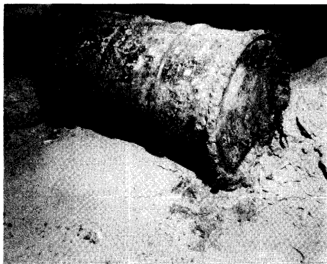
Figure 2: Radioactive waste container on the floor of the Atlantic Ocean.